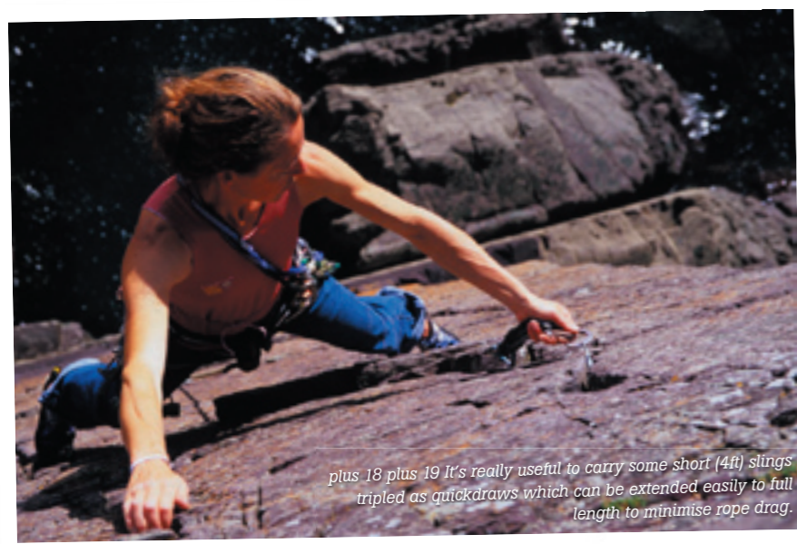
plus 18 plus 19 It's really useful to carry some short (4ft) slings tripled as quickdraws which can be extended easily to full length to minimise rope drag.