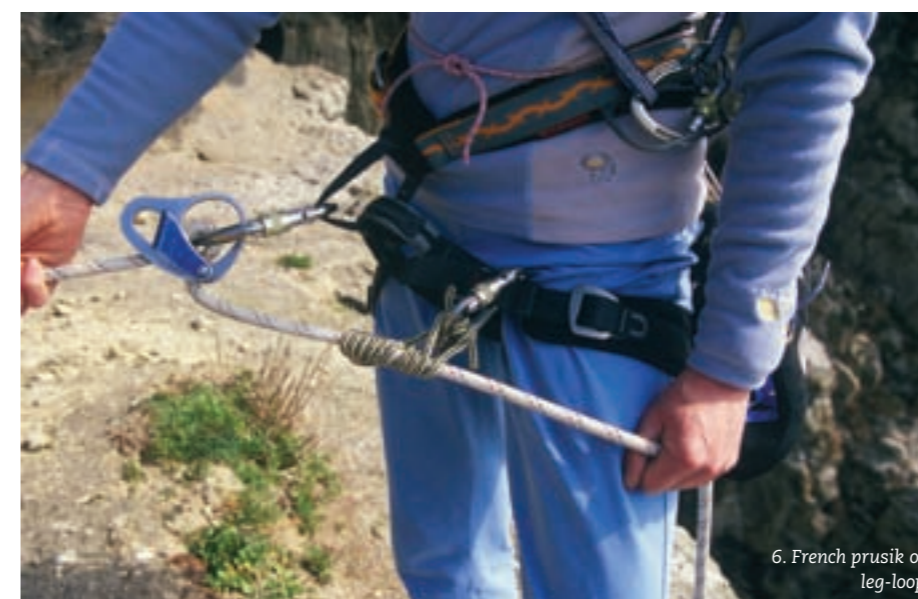
6. French prusik on leg-loop.

Often you won't get a view of your climb until you're standing underneath it so it's worth having a plan B in case it's wet. Lines that are prone to seepage are usually obvious and the guidebook may highlight this but it's incredibly hard to predict whether the rock on