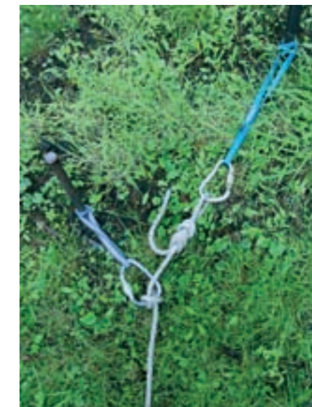
2. Two stakes and clove-hitch.

will be stakes driven into the ground. You'll encounter the full spectrum of quality so inspect them with a critical eye. ALWAYS use more than one and link them so they share the load; a few methods are shown in photos 1-5. Note the slings are clove-hitched to the stakes to stop them rotating and the cross of the clove-hitch is positioned at the back of the stake to further help it tighten.