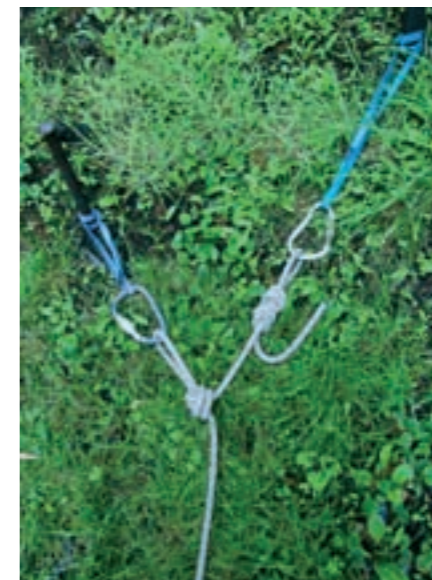
1. Two stakes and overhand knot.

In-situ abseil anchors: These are common at well-used venues and more often than not