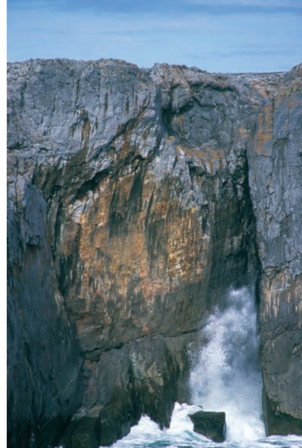
▶ Never underestimate the power and unpredictability of the sea. A freak wave halfway up the Ivory Tower, Bosherton Head, Pembroke.

the day may have a hideous greasiness. This is common sea-cliff blight that isn't caused by rain – just by dampness in the air – of which there's always loads! It's invariably wise to let the sun hit the crag before you do, so check the aspect. Gogarth is a great example of a perfect afternoon/early evening cliff as it mostly faces northwest. It's common to see cold and unhappy teams on Dream of White Horses , who arrived early to beat the crowds only to find the delicate crux pitch a slippery horror-show.