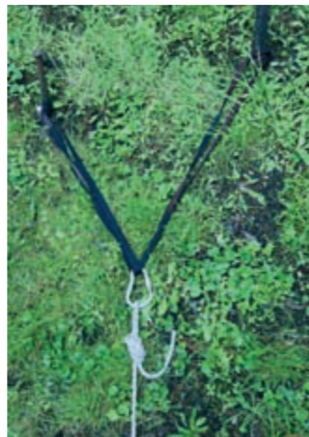
4. Two stakes and black slings.