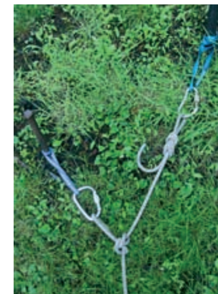
3. Two stakes and alpine butterfly.

If you have to use a short stake and are worried about the rope jumping off you can add a clove-hitch above the figure of eight, as in photo 5.