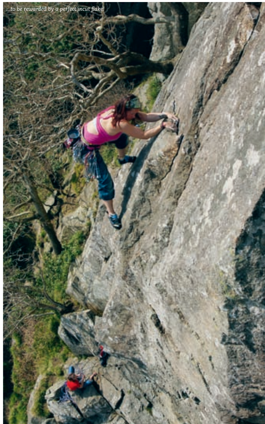
...to be rewarded by a perfect incut flake!

closer to basalt as it contains a higher proportion of iron and magnesium, giving it a darker colouring. It typically forms slabs and blocks and the varying crystal size and exact chemical make-up determines its roughness.