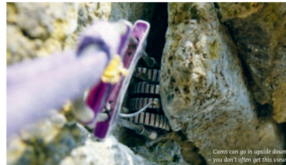
Cams can go in upside down – you don't often get this view.