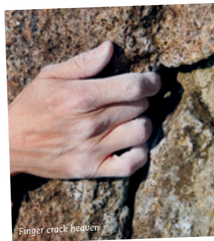
Finger crack heaven