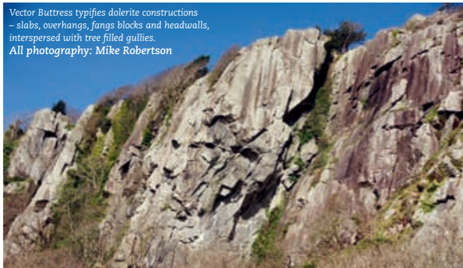
Vector Buttress typifies dolerite constructions – slabs, overhangs, fangs blocks and headwalls, interspersed with tree filled gullies.

Dolerite moves typically require creative thinking coupled with precise and confident footwork. On first arrival the move ahead can be completely baffling. Luckily, more often than not, once the initial panic subsides you realise you're standing in balance on a steep slab so have plenty of time to think about what to do next. This of course is a double edged sword; if you can stand in balance working out the next sequence of moves, it also means there's no sense of urgency so if you don't like the look of what lies ahead it's very hard to get started again. In other words, you can quite simply grind to a halt.