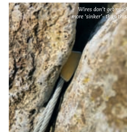
Wires don't get much more 'sinker' - than this!

A special mention goes to the translucent slugs at Tremadog after rain – I'm sure they have a proper name and important role to play in the ecology of the nature reserve but that doesn't make them any more attractive when they're occupying the same handhold as you. □