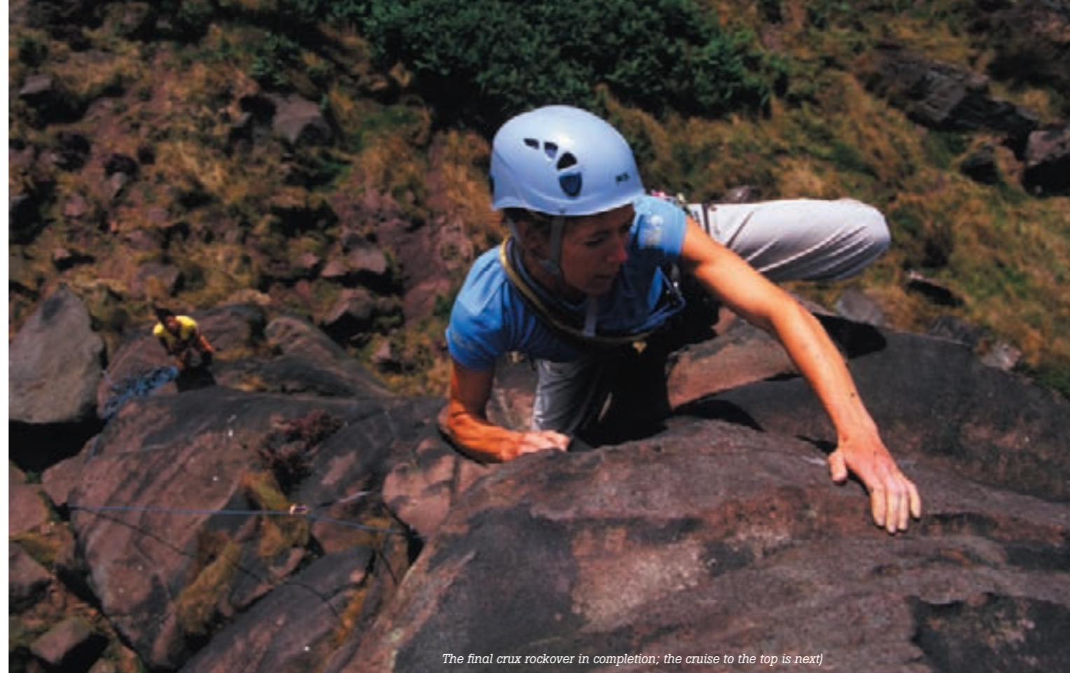
The final crux rockover in completion; the cruise to the top is next!

to be 100% solid should you use just one, otherwise use as many as it takes until you feel reassured that your belay would hold you and your falling partner.