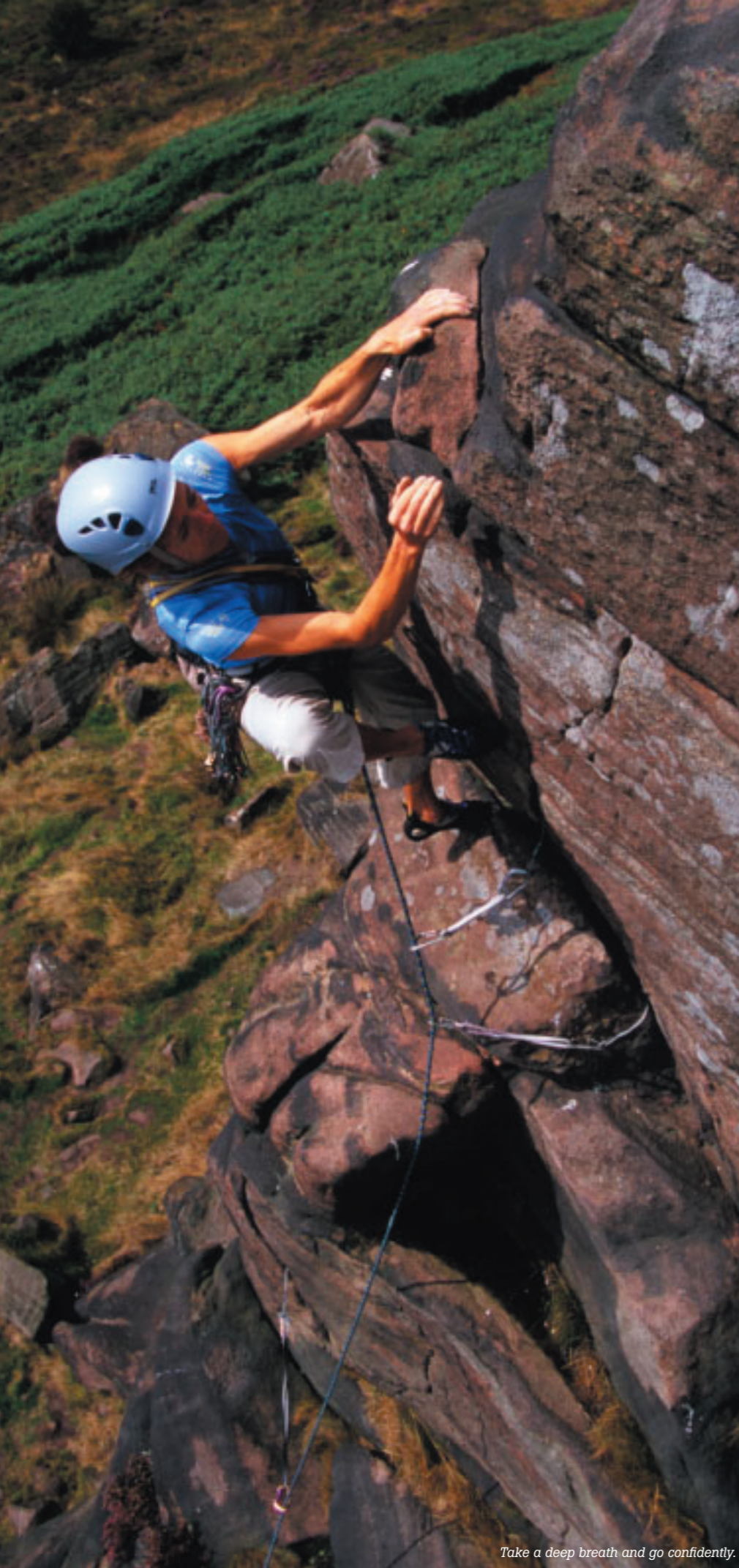
Take a deep breath and go confidently.