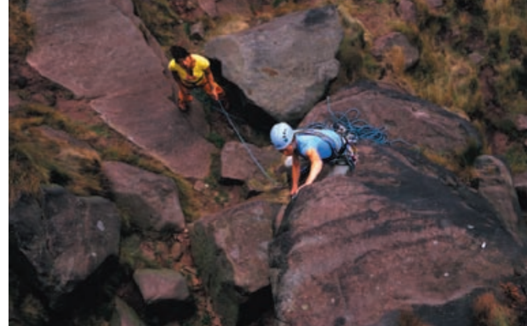
Big holds albeit on steep ground typifies V. Diff on grit.